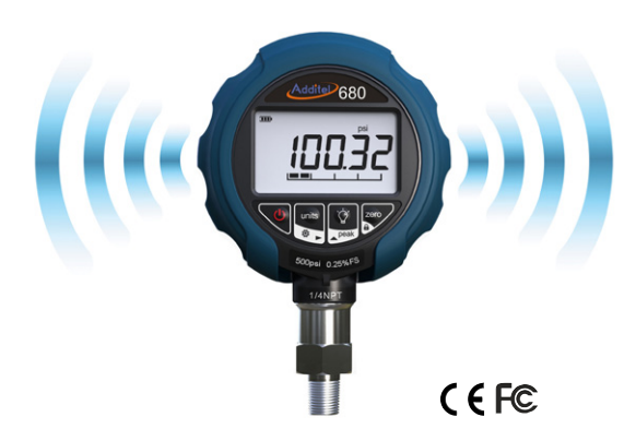
680 with data logging and wireless (optional)