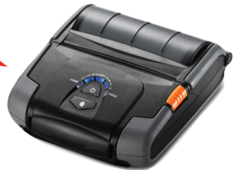
Test Tags PAC-OPT AS/NZS3760 Test Tag Printer